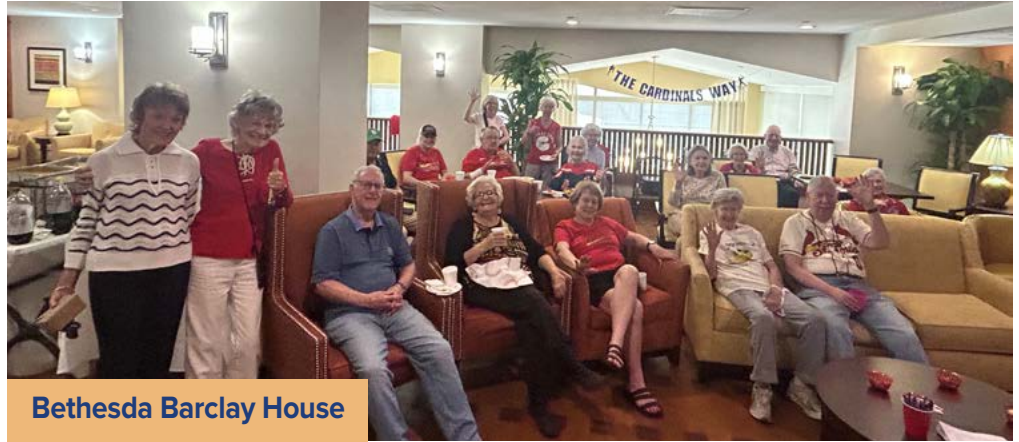
Bethesda Barclay House

Good friends, good food and Cardinal baseball—now that's a winner!