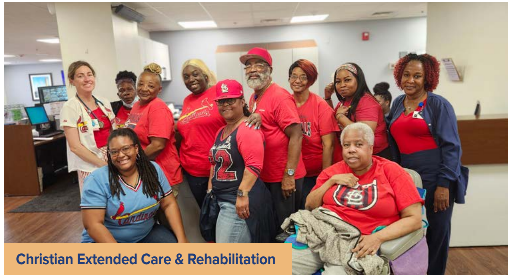
Christian Extended Care & Rehabilitation