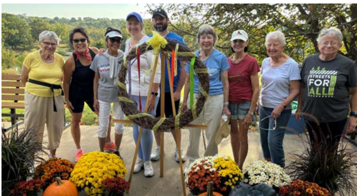
The Bethesda Orchard team of residents and staff posed for a photo before the walk began. By the end of the walk, the wreath was covered with commemorative ribbons.