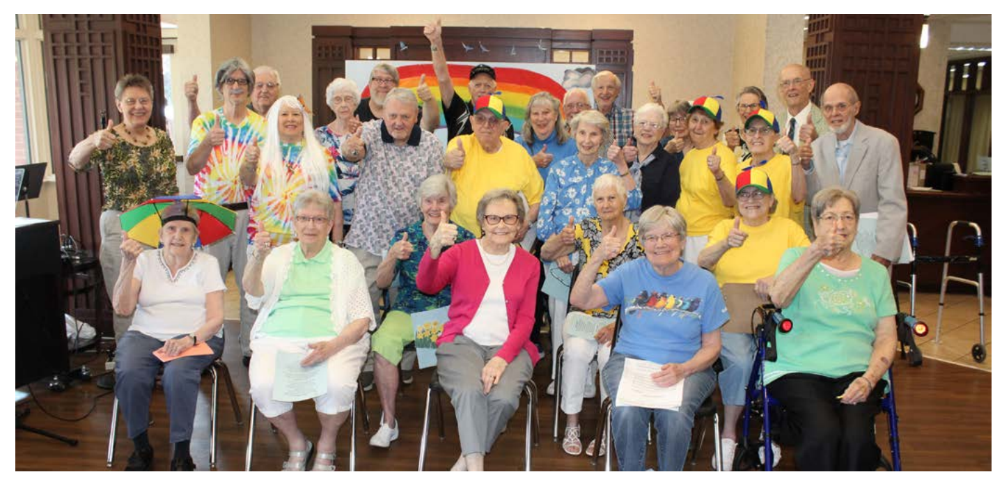
The cast of the 2024 Orchard Follies gathers for a photo.

To watch the Follies, type www.youtube.com/BethesdaHealth into your internet browser, press enter and click on the video. It should be the first video you'll see.