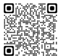
Scan to register or learn more about the Kayman 5K

Sign-up by September 1 and receive a free t-shirt.