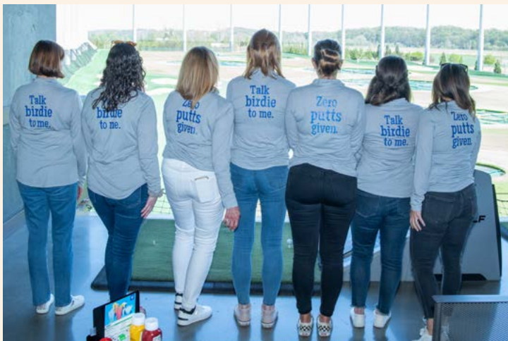
The team from Common Ground Public Relations show off their matching uniforms, complete with witty golf-related phrases!