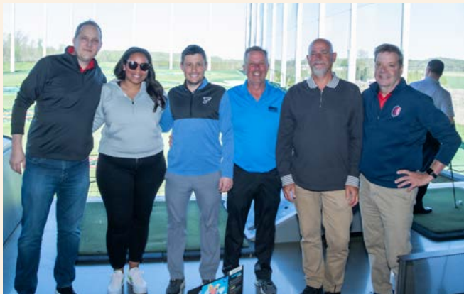
This is just one of the five teams representing Midwest Elevator, the premier sponsor of the 2023 Birdies for Bethesda Golf Tournament.

Scan here to watch a video from the event.