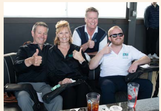
Congratulations to the team from BTX—our 2023 Birdies for Bethesda winners!