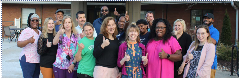
The CECR team gives a "thumbs up" in response to winning "Best of North County" awards.

The Hearts for Our Homes campaign begins May 1 and ends June 30. For more information, or to donate, please call 314-800-1916 or go to www.bethesdahealth.org/giving-to-Bethesda . ■