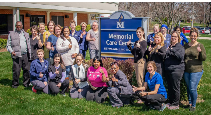
Members of the team from Memorial Care Center (MCC) gathers together on April 1 to commemorate the day in which Bethesda began managing the short-stay rehab community.