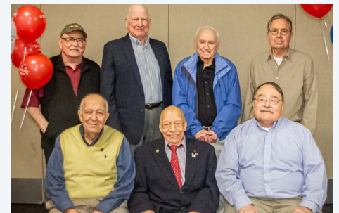
(L-R) Some of the Bethesda residents and volunteers who were honored at the March 29 luncheon took time to pose for a photo.