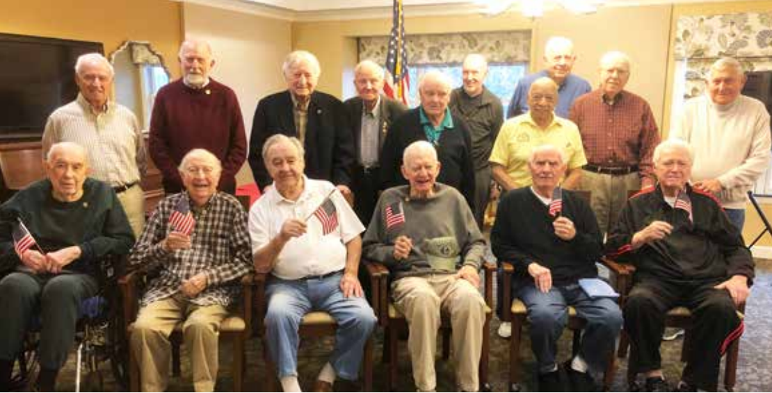
A handsome group of Veterans living at Bethesda Gardens (plus one who lives at The Oaks) gather during the Veterans Day pinning ceremony. Each community holds a pinning ceremony on this day to honor Veterans and their spouses.