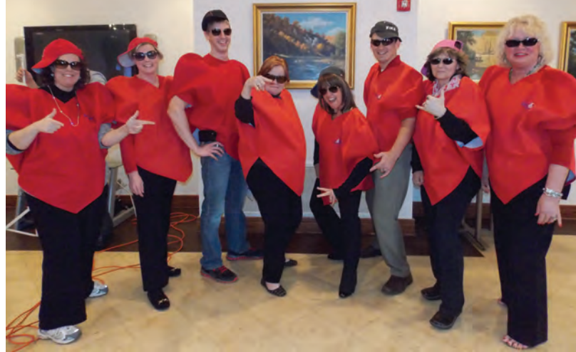
The creative antics of the "Hearts for Our Homes" ambassadors helped raise a record $100,000 during the 2014 employee and resident campaign.