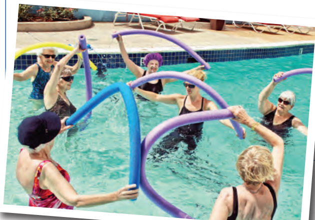
The water aerobics classes at the Bethesda Barclay House pool keep the residents active and healthy.