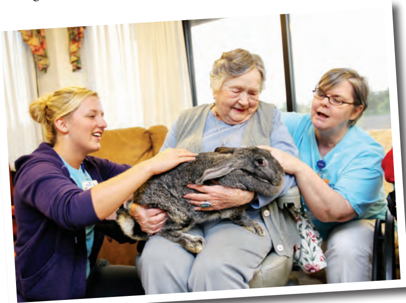
Rabbits make routine visits at Bethesda Dilworth, offering residents gentle, warm companionship.

Communities have hosted area students through a variety of programs—including poetry reading, crafting, and reciprocal visits where residents visit the