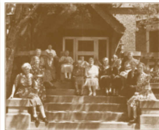
Photo taken in 1945, a group of ladies pose on the front porch at Bethesda's Home for the Aged.