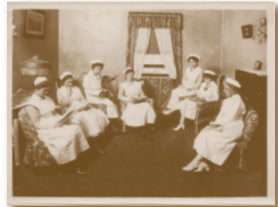
Students from Bethesda's School of Nursing study together.